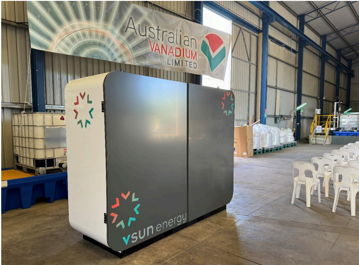
Figure 4 - VSUN Energy prototype residential vanadium flow battery