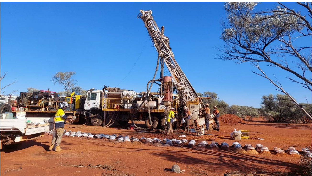
Figure 1 – RC Drilling at the Australian Vanadium Project

Drilling results in 2020 and metallurgical work in 2021 identified increased vanadium concentrate grades and iron titanium (FeTi) coproduct grades in the southern blocks. This recently completed drill program (Figure 1) infills drill lines to a spacing of 70m by 30m in the top 100m vertically of early mine-life BFS pit optimisations in block 60 and 50. This is the same drill density which currently supports the Measured Mineral Resource category in northern blocks 15 and 20.