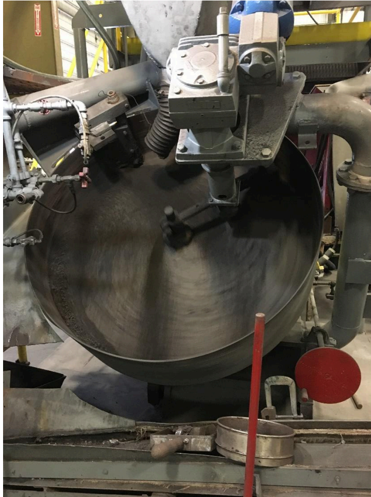
Figure 3 Kiln feed being prepared in pelletising pan