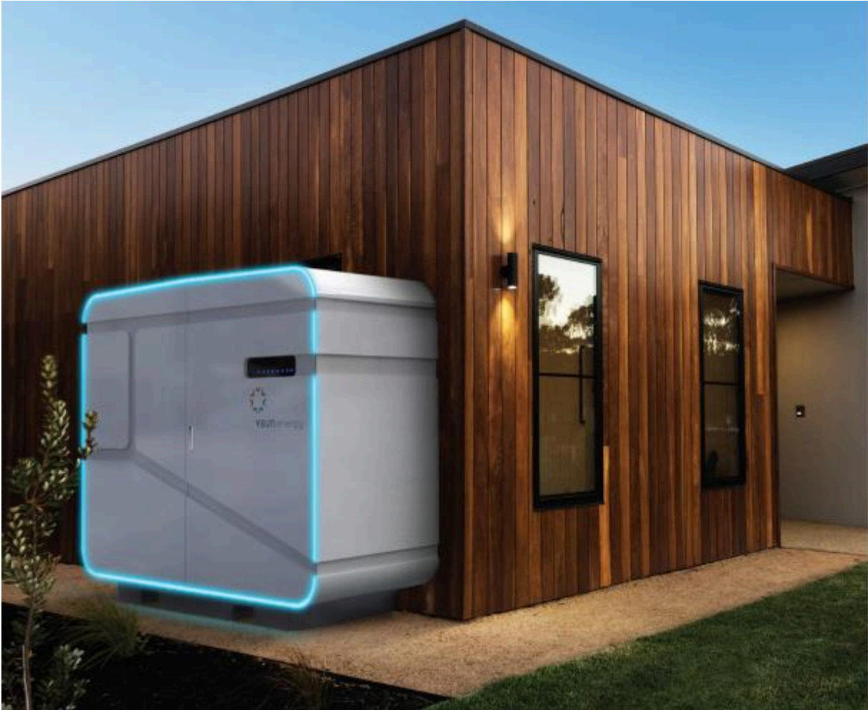
Figure 5 Concept design for the 5kW/30kWh residential VRFB

VSUN Energy has also recently ordered a 5kW/30kWh VRFB from V-Flow Tech in Singapore for a regional residential customer in Western Australia 6 and a 5kW/30kWh VRFB from V-Flow Tech for the Beverley Caravan Park in Western Australia.