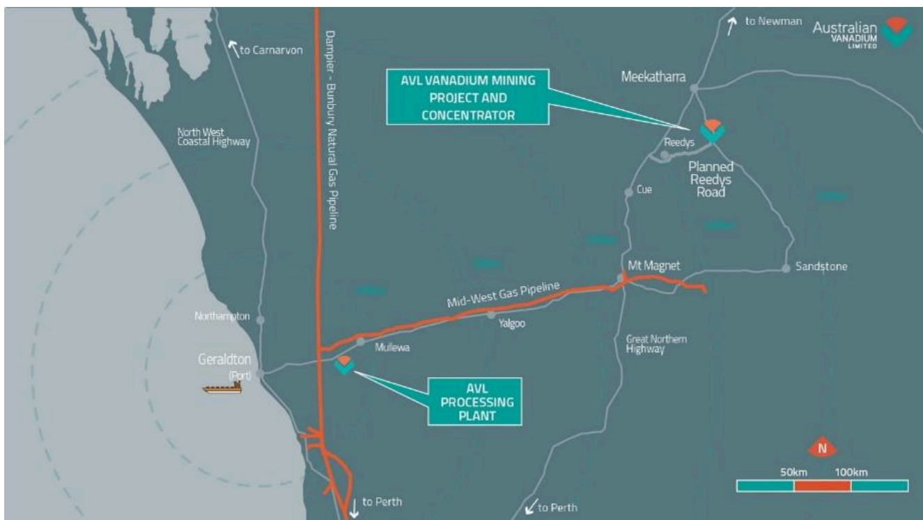
Figure 1 Project Location Map