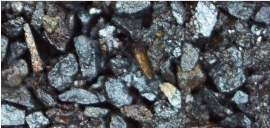
Figure 1 Magnetic concentrate sample from 6 tonne pilot

AVL's target concentrate quality has a \text{SiO}_2 content <2\% and \text{V}_2\text{O}_5 grade of 1.4\% based on the Company's pre-feasibility study, (see ASX announcement dated 19 December 2018 'Gabanintha Pre-Feasibility Study and Maiden Ore Reserve').