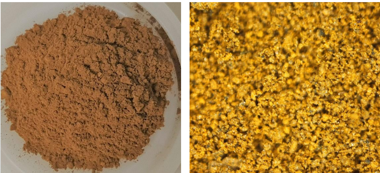
Plate 1 - AVL's V_2O_5 product (right hand side image of product under microscope)

An alternative vanadium production route known as APV (ammonium polyvanadate) was tested on the leachate produced by roasting and generated a final product quality of 99.4% V_2O_5 , which was independently verified by an accredited laboratory (see Plate 1). The APV process showed reduced reagent consumption and the potential to eliminate the desilication step required in the AMV (ammonium metavanadate) process which was considered in the PFS.