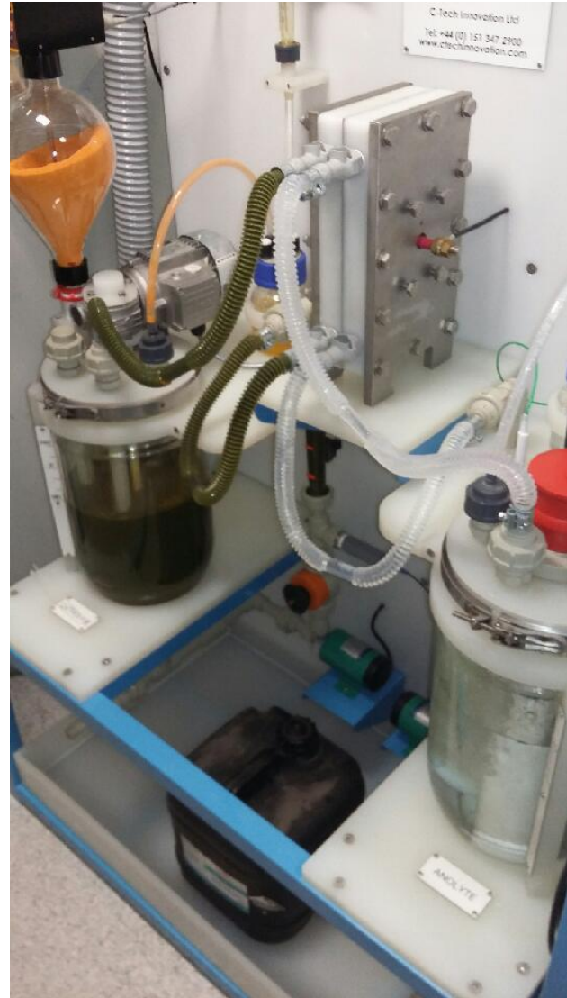
Figure 2: Electrolyte Pilot Plant. 99.6% V_2O_5 (orange), feeding AVL electrolyte balancing pilot plant