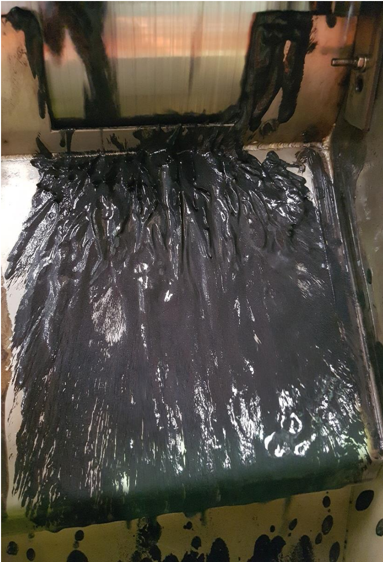
Figure 1: An example of magnetic concentrate (titaniferous magnetite containing vanadium) from a fresh rock sample