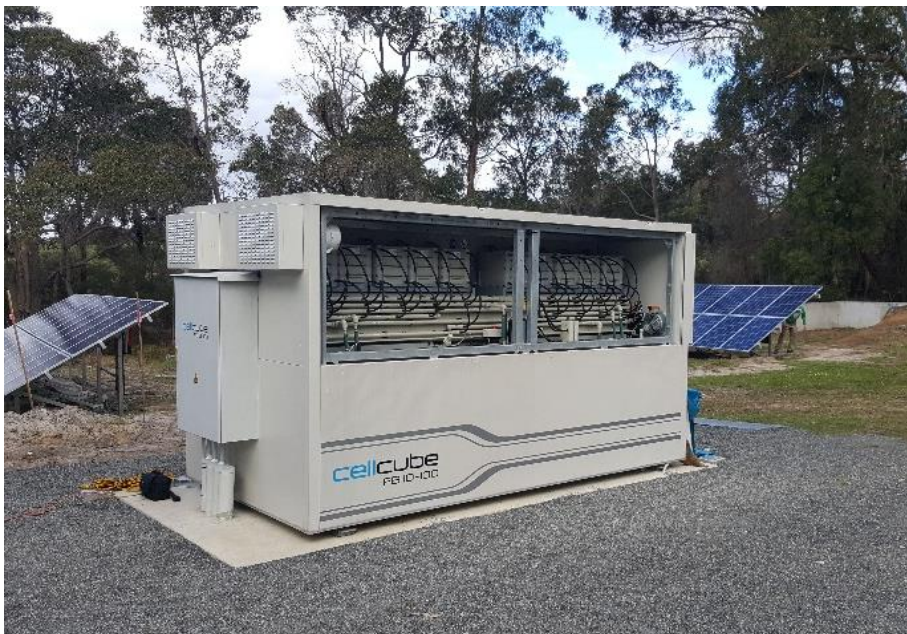
Figure 3 Vanadium redox flow battery in Busselton, Western Australia

The battery VSUN Energy installed at a native tree nursery in Busselton in late 2016 (see ASX Announcement dated 18th May 2016) is a 10kW power system with 100kWh of energy storage, meaning that it can deliver 10kW for 10 hours or with a smaller load, provide 5kW continuously for 20 hours. This vanadium-based battery has been performing continuously as a SPS since that installation date. The 10kW-100kWh system has required minimal maintenance and used 0kW of grid electricity since installation. It has not needed to draw energy at all from the grid in over a year and a half of operation, in spite of cloudy periods during the winter. It is still performing in the same manner as it was when it was installed.