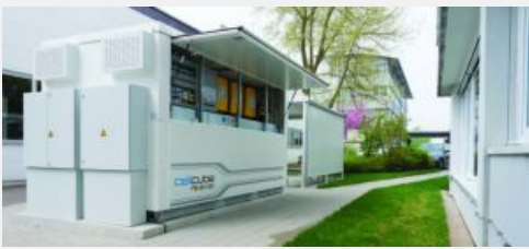
Gildemeister has installed its CellCube VRFB systems, mainly in commercial and industrial applications

By comparison, to make the electrolyte solution for a VRFB about 145 grams of vanadium pentoxide per litre is needed. For a 1.6MWh flow battery that's equivalent to 15 tonnes.